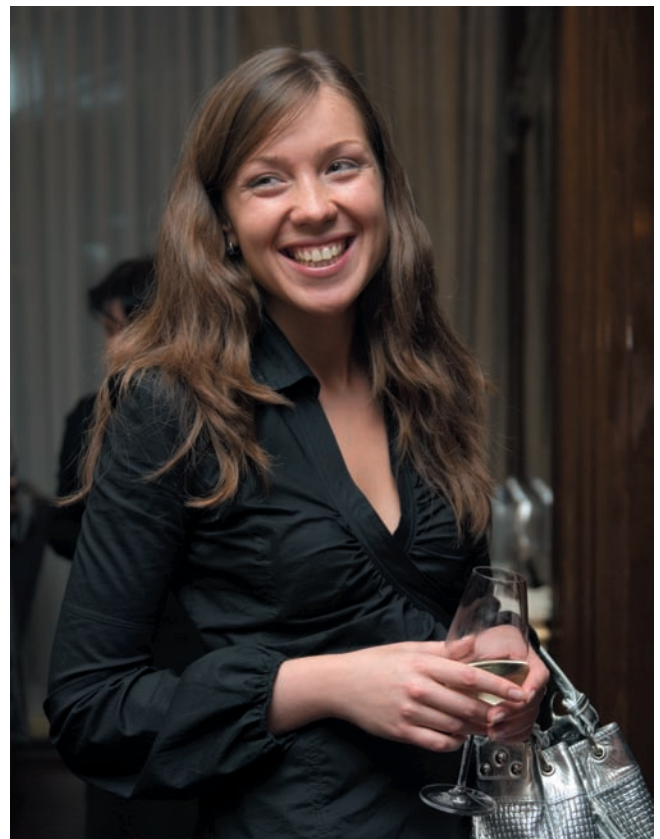
Elena Serebryakova International Moscow Bank